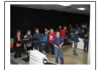
Bowl A Thon !

Don't forget to bring you bikes and helmet.